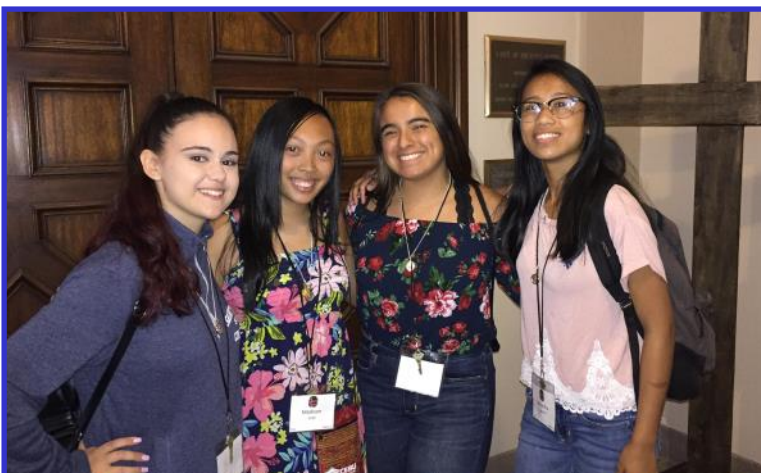
Youth On A Mission at St. Mary's College