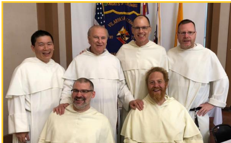
The "Gang" was all here! The Dominican Province Assembly