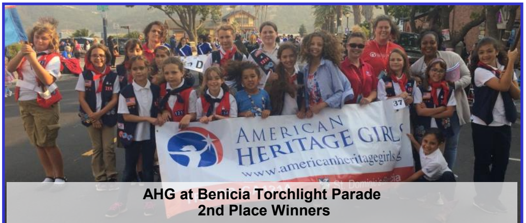
AHG at Benicia Torchlight Parade 2nd Place Winners