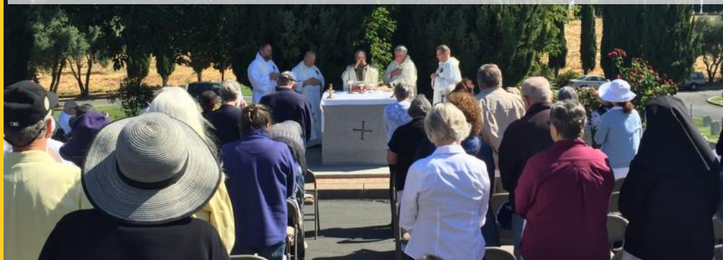
St. Dominic's Cemetery Mass with Bishop Soto Formally Consecrating the cemetery grounds