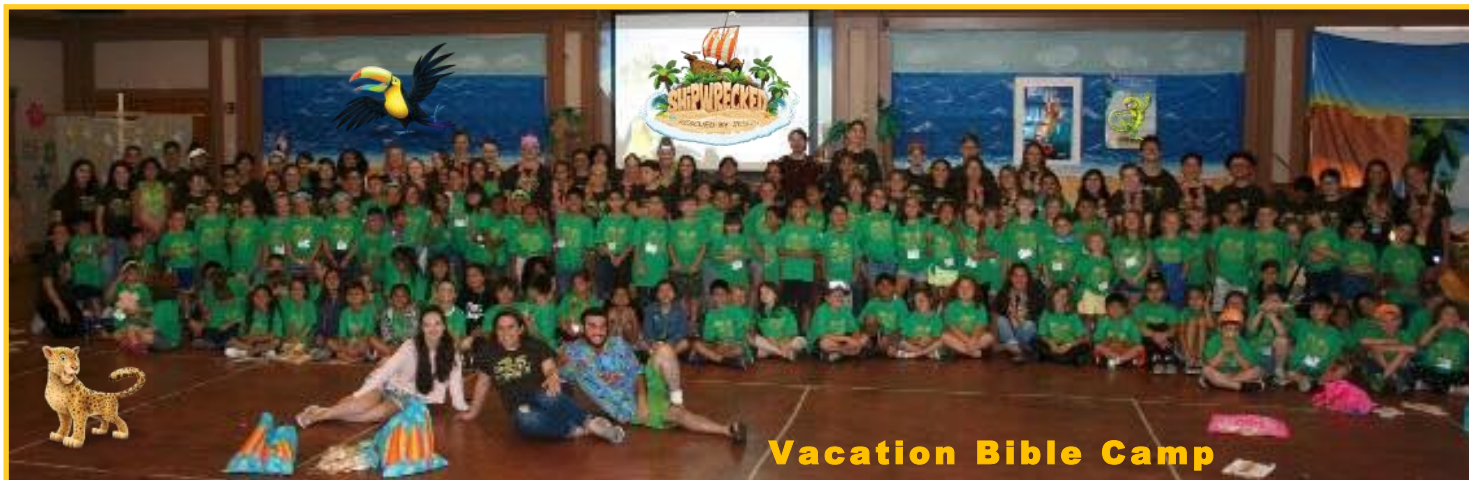
Vacation Bible Camp

This year we had 114 campers and 70 volunteers