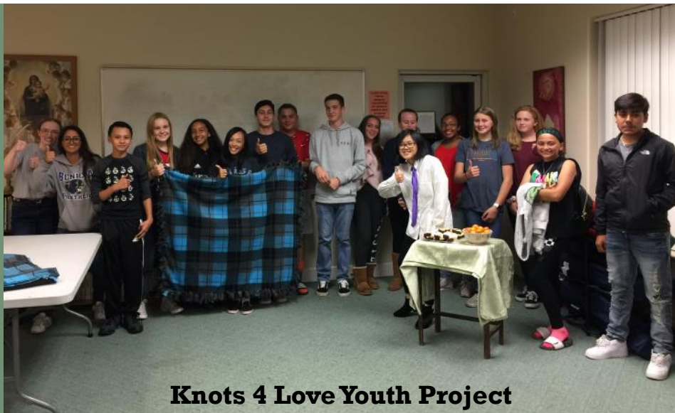
Knots 4 Love Youth Project

“Amen, I say to you, this poor widow put in more than all the other contributors to the treasury”