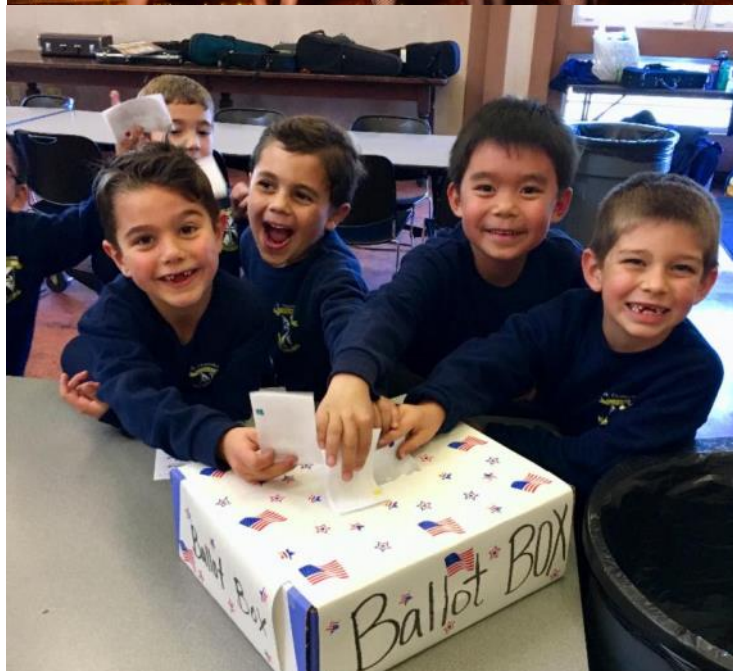
Students Participating in Voting Day