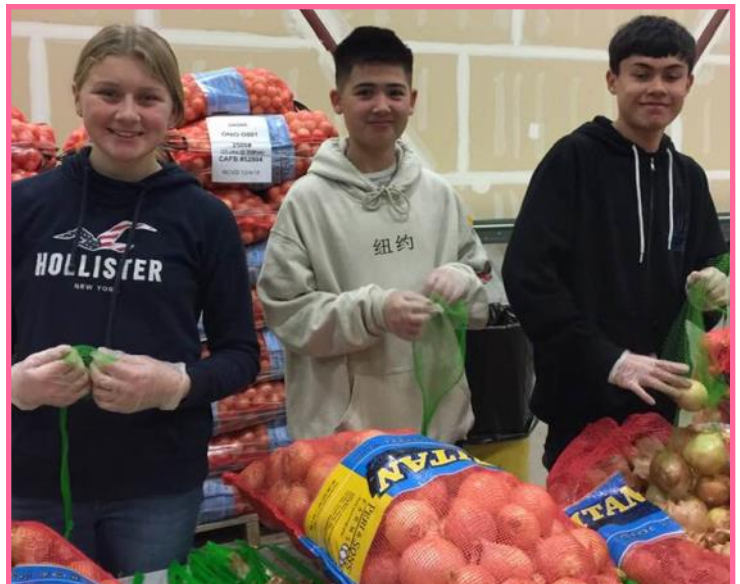
Volunteering at the food bank