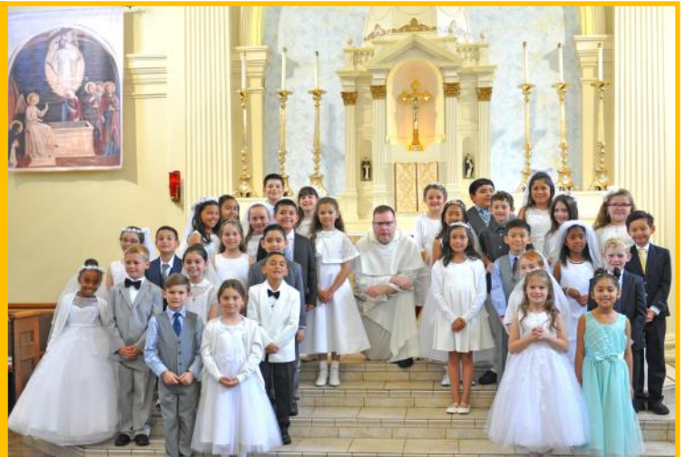
Second Grade First Eucharist Mass