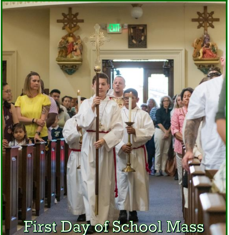
First Day of School Mass