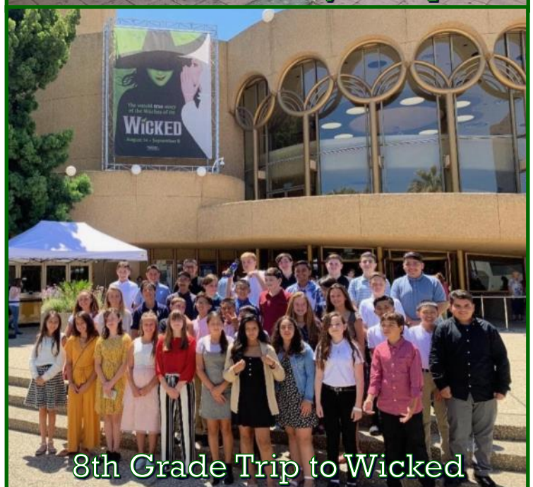
8th Grade Trip to Wicked