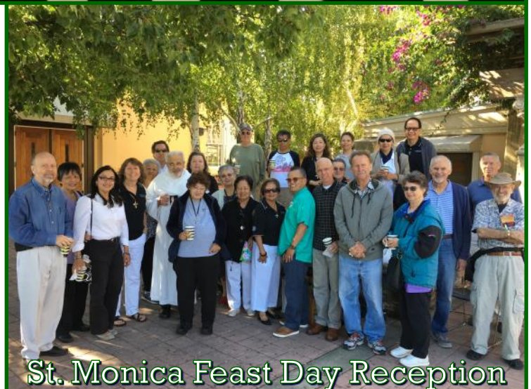
St. Monica Feast Day Reception