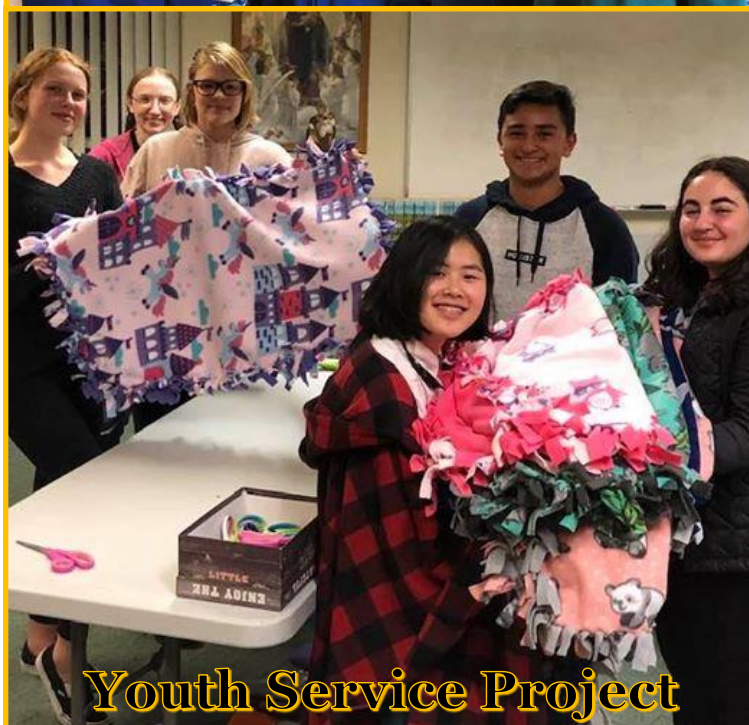
Youth Service Project