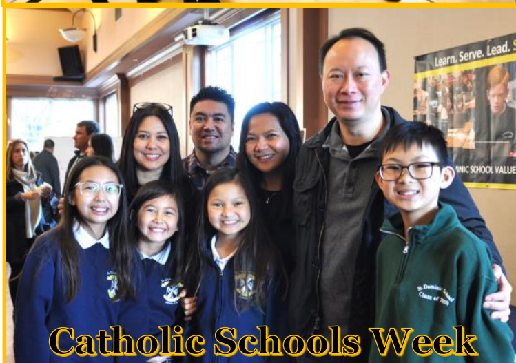
Catholic Schools Week