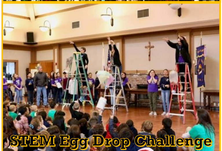
STEM Egg Drop Challenge