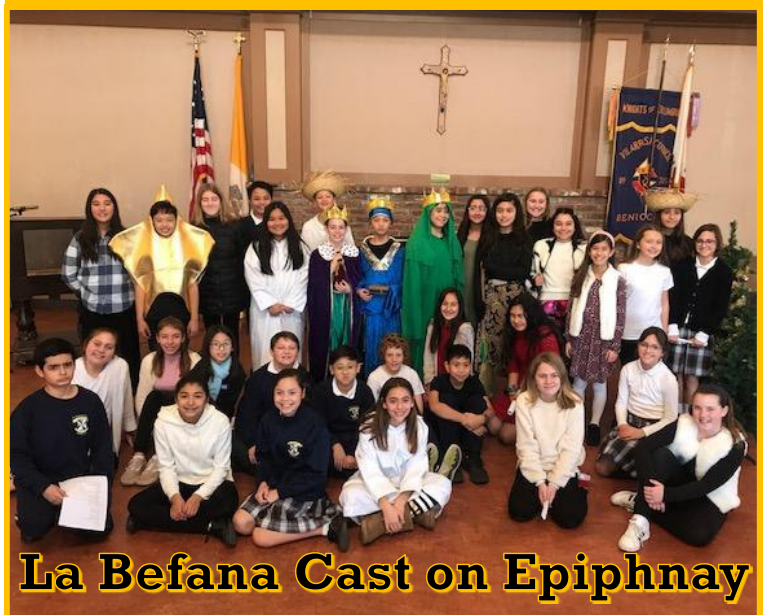
La Befana Cast on Epiphany