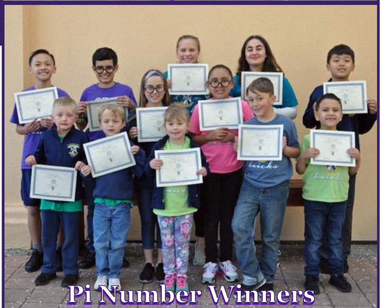
Pi Number Winners