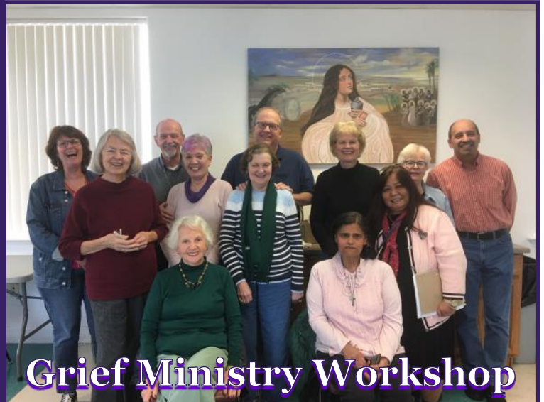
Grief Ministry Workshop