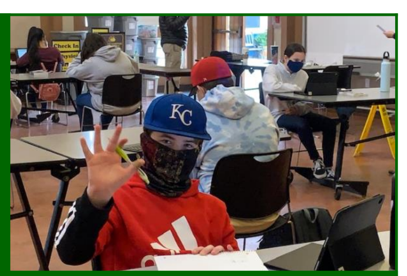
St. Dominic School STAR testing is underway!