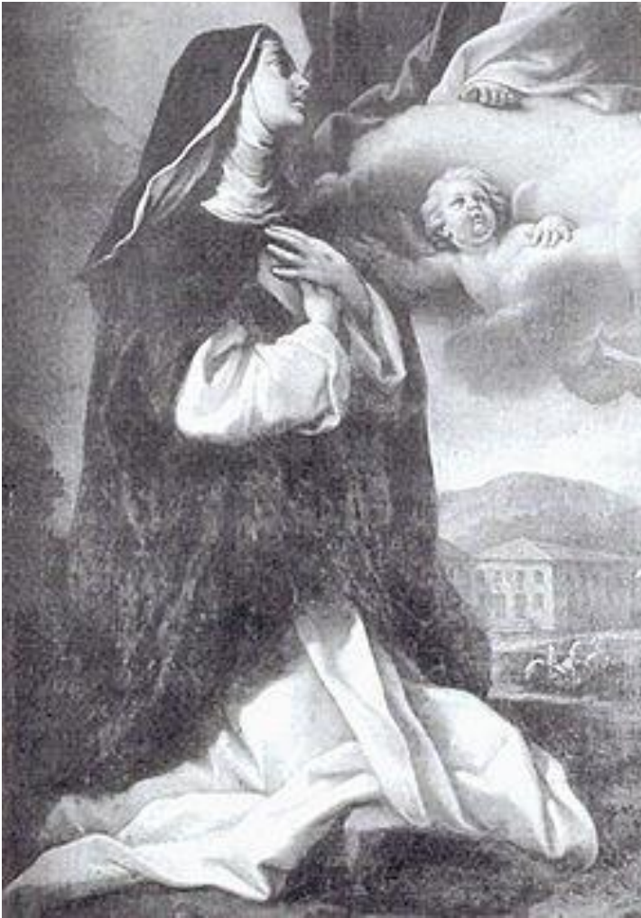
November 14 - Blessed Lucy Brocadelli, virgin and sister