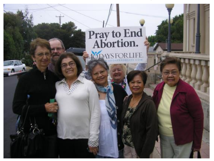
Vallejo/Benicia/American Canyon CA – Dear brothers and sisters.

Peaceful, prayerful, effective 40 Days for Life campaign to build on successes in Vallejo/Benicia/American Canyon, CA