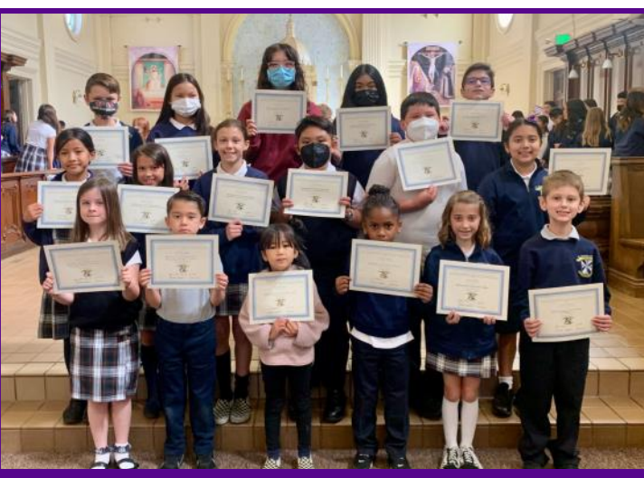
March's Award for Integrity

Mass & Flower Intentions ONE Mass Intention per family, please visit the office. April 1 Mass intentions open for May.