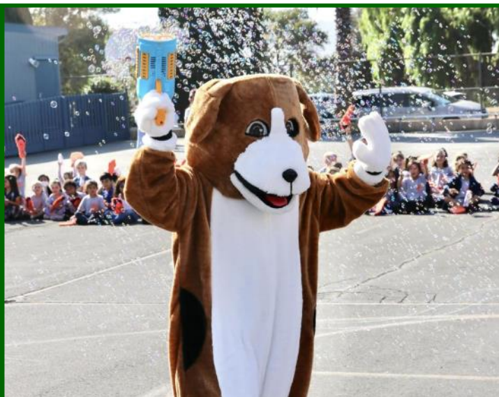
Welcome SDS Mascot -Torch

“I will praise your name forever, my king and my God.”