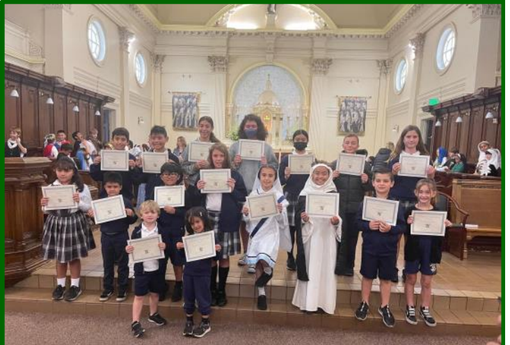
SLE Award for Faith

“Lord, when your glory appears, my joy will be full.”