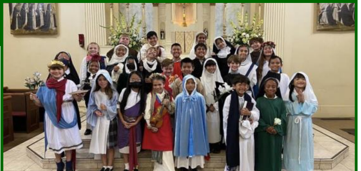
3rd Grade Saints